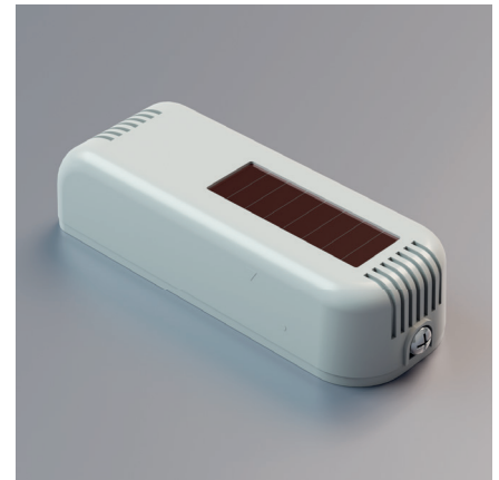
Temperature and humidity mini sensor