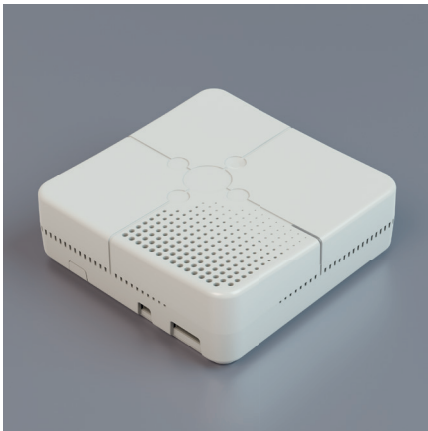
Indoor air quality sensor

Pressac's environment monitoring sensors accurately measure the surrounding environment, so you can monitor room-level conditions and automate controls in near real time. The range of multi-sensors can measure carbon dioxide (CO 2 ), temperature, humidity, particulate matter (PM1/PM2.5/PM4/PM10), and total volatile organic compounds (TVOC).